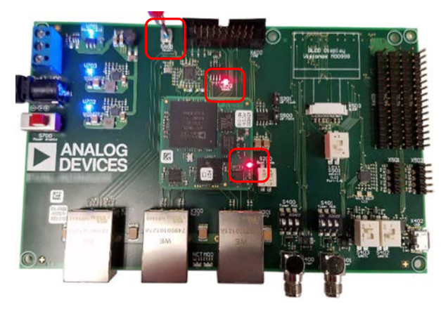
Figure 4. Reset Switch Location and Reset LEDs

3. If it is necessary to reset the evaluation board, press the Reset switch, which illuminates two red LEDs, as shown in Figure 4.