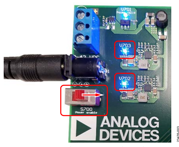
Figure 3. Power Switch in ON position and 5 V and 3.3 V LEDs

2. Switch the Power Enable switch on the baseboard to the ON position, as shown in Figure 3. The 3.3 V LED (V702) and the 5.0 V LED (V703) illuminate blue.