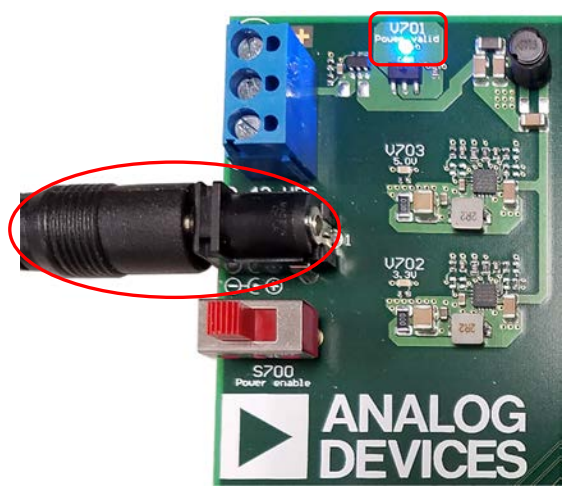
Figure 2. Power Cable Connection and Power Valid LED

Plug the provided ac adapter into the wall socket, and connect the barrel connector of the ac adapter to the baseboard, as shown in Figure 2. The Power Valid LED illuminates blue. At this point, the evaluation board is powered.