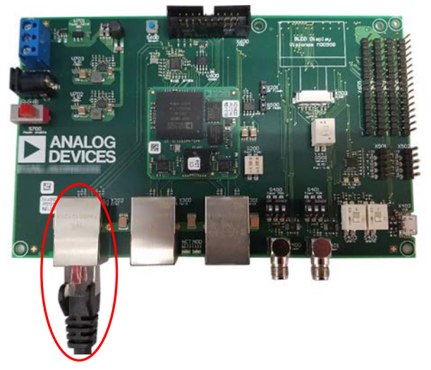
Figure 5. Ethernet Cable Connection

Install the provided Ethernet cable between the host PC and the host port of the evaluation board as shown in Figure 5.